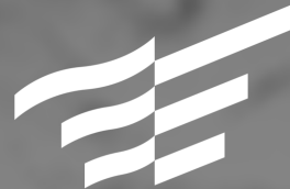
الهيئة العامة للنقل RANSPORT GENERAL AUTHORITY