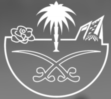
أمانة الطائف TAIF MUNICIPALITY