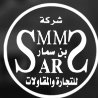
شركة SMM بن سمار SAR للتجارة والمقاولات