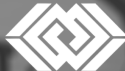
شركة مطلق الغويري للمقاولات Mutdaq Al-Ghowairi Contracting Co.