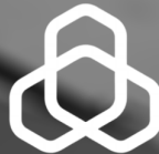
مصرف الراجحي alrajhi bank