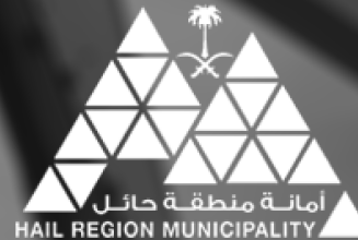
أمانة منطقة حائل HAIL REGION MUNICIPALITY